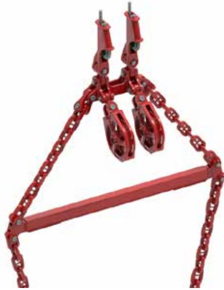
Hoist circuit for traditional ProFill bucket

The hammerless G.E.T. locking systems and fewer rigging components streamlines maintenance and improves site safety by reducing worker exposure and touch time.